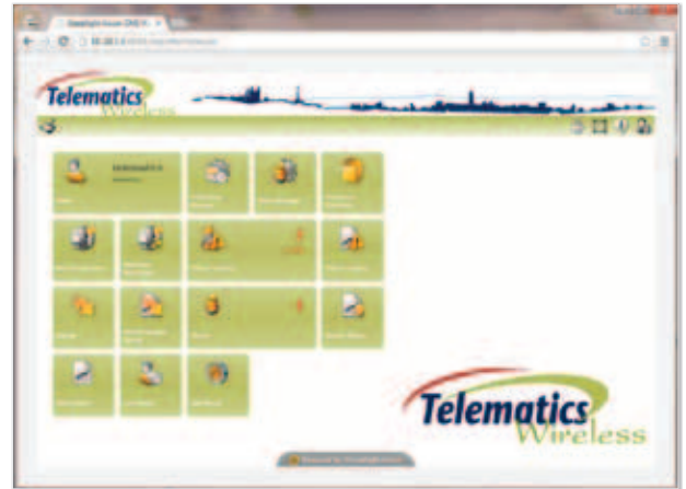
Dashboard Screen — access to various CMS functions