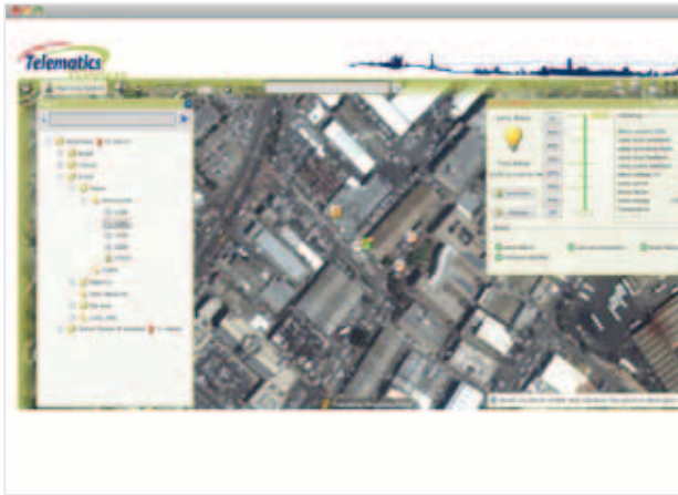
GIS Screen — Based on a Google map, the GIS option displays the geographic location of each light pole with its dynamic parameters