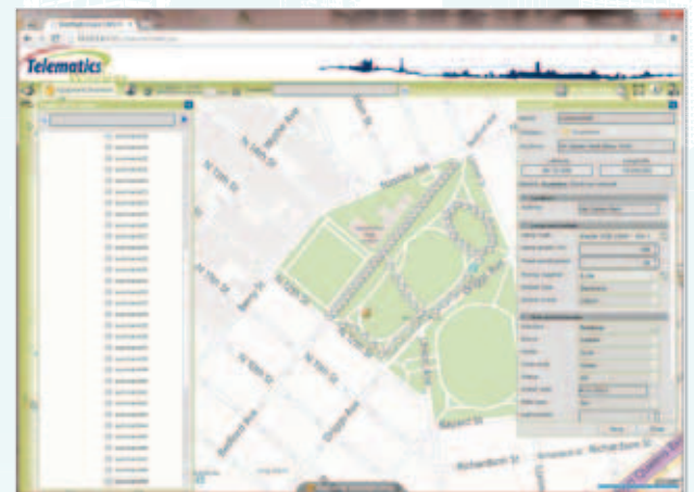
Equipment Inventory Screen – specific luminaire data