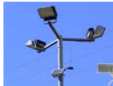
Repeater with optional Solar Panel for fully autonomous operation