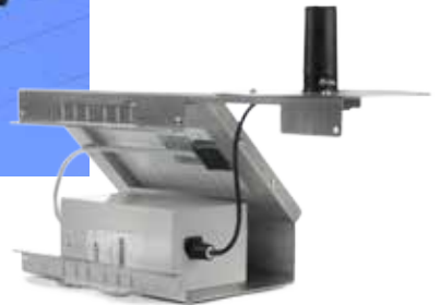
When needed repeaters are used to cover "dead zones" or to increase the coverage range

Telematics Wireless is a recognized global leader in the delivery of robust, reliable and advanced energy and water resource management systems based on RF wireless networks. With almost 20 years of experience in Machine-to-Machine (M2M) technologies, our solutions support a wide spectrum of smart city applications, increasing their efficiency, reliability, and cost-effectiveness. Telematics Wireless has delivered and installed over 14 million cutting-edge wireless devices and water systems for Automatic Meter Readings (AMR), Advanced Metering Infrastructure (AMI), energy resource management, smart grid, street and outdoor lighting control systems, location-based services, asset tracking and monitoring, and electronic toll collection.